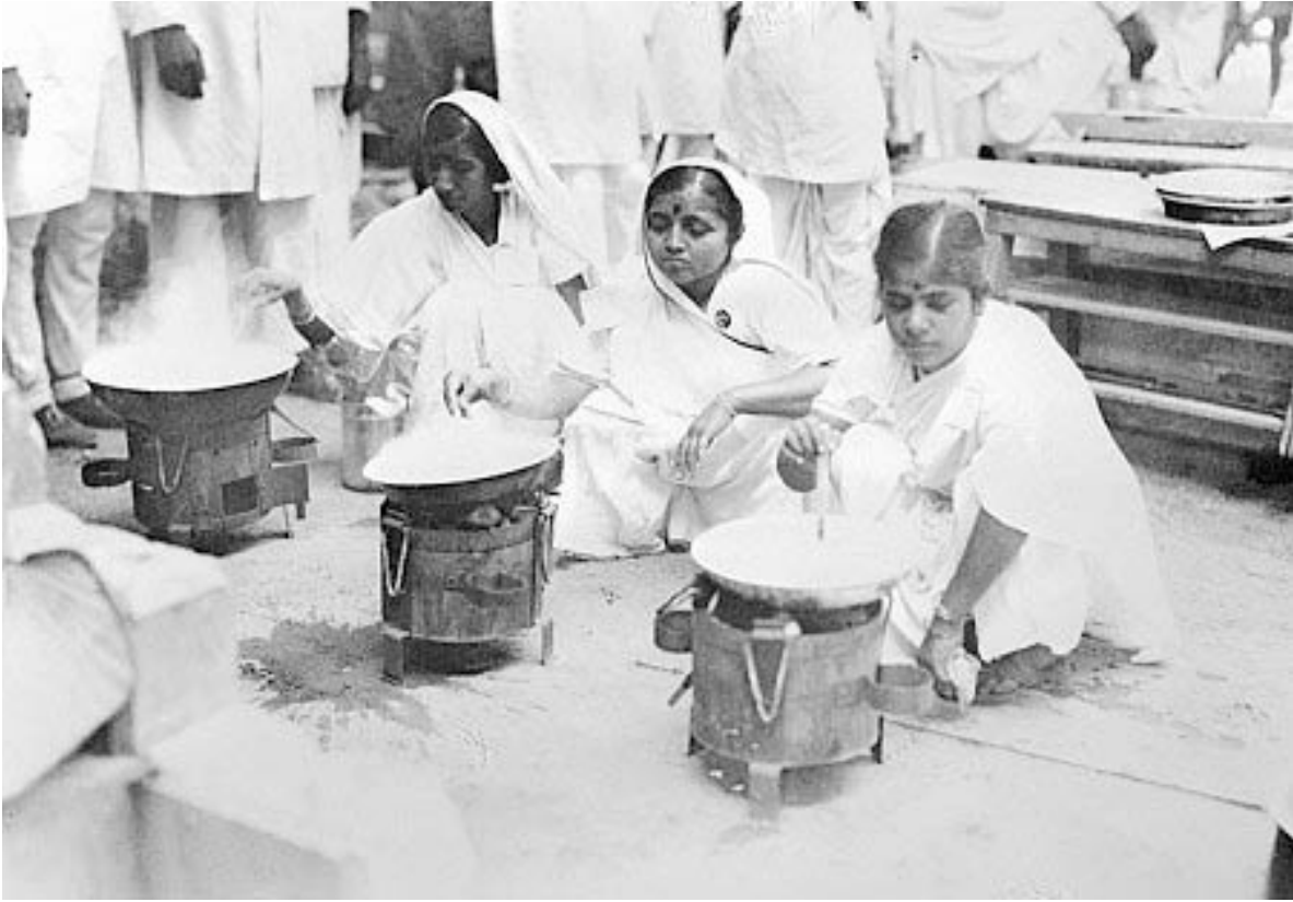
Photograph 1: Women at Salt march, April 1930

( http://commons.wikimedia.org/wiki/Image:Salt_March_meal_preparation.jpg )