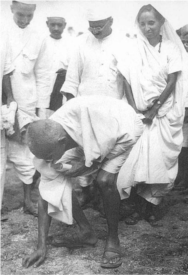
Photograph 4: Gandhi at Dandi, South Gujarat, picking salt on the beach at the end of the Salt March, 5 April 1930