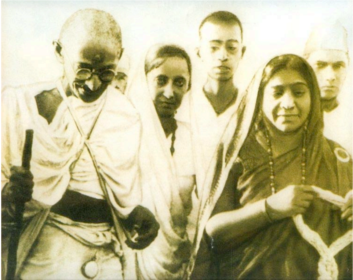
Photograph 5: Mahatma Gandhi and Sarojini Naidu (lower right) on Salt March, 1930

( http://en.wikipedia.org/wiki/Image:Mahatma_%26_Sarojini_Naidu_1930.JPG )