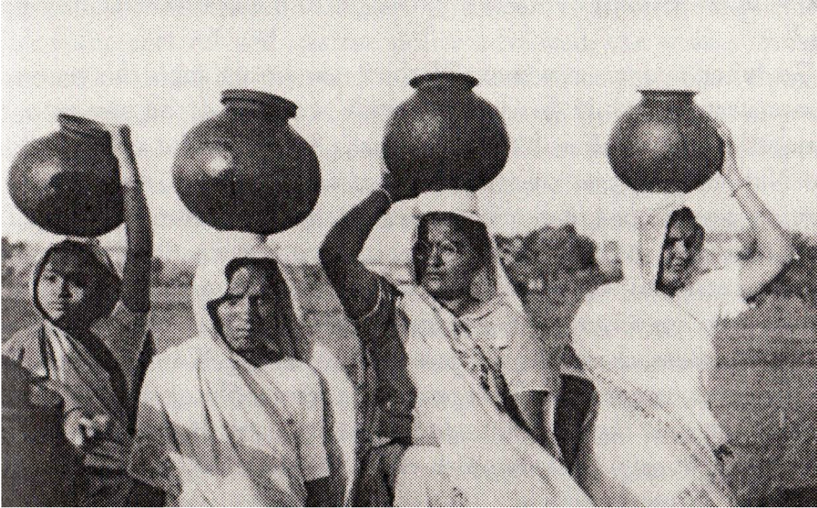
(Geraldine Forbes. Women in Modern India . Cambridge: Cambridge University Press. 1996. Pg. 133)